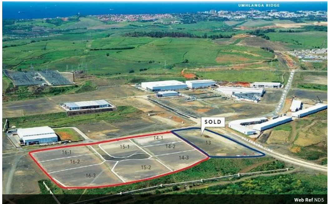
Web Ref ND5

Suite 118 Beacon Rock, 21 Lighthouse Road, Umhlanga Rocks, 4319