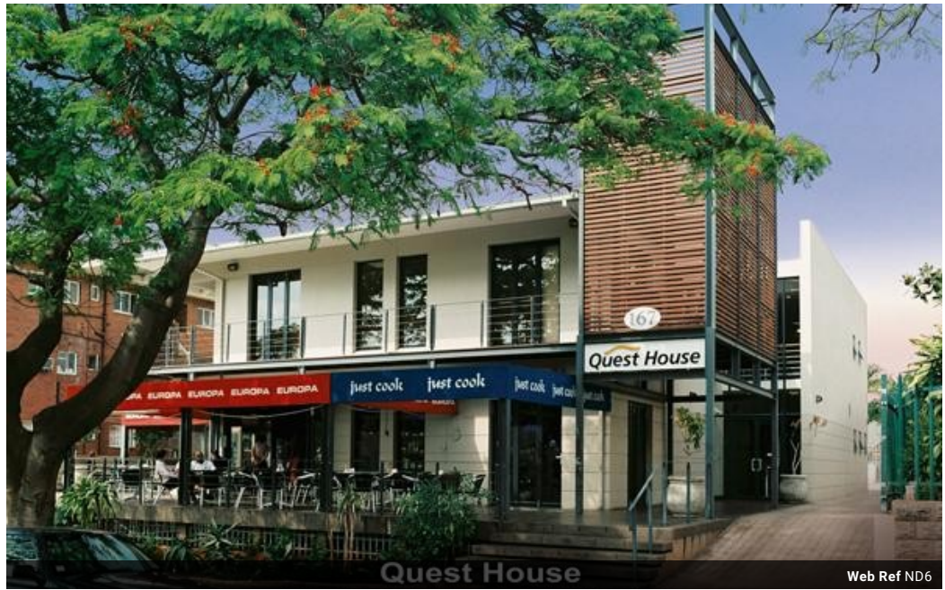
Web Ref ND6

Suite 118 Beacon Rock, 21 Lighthouse Road, Umhlanga Rocks, 4319